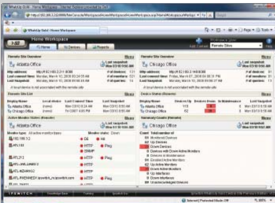
Highly visual and instantaneous status of the complete infrastructure.

WhatsUp Gold Distributed Edition builds on the powerful WhatsUp Gold architecture to deliver a highly scalable, low bandwidth solution for distributed environments that: