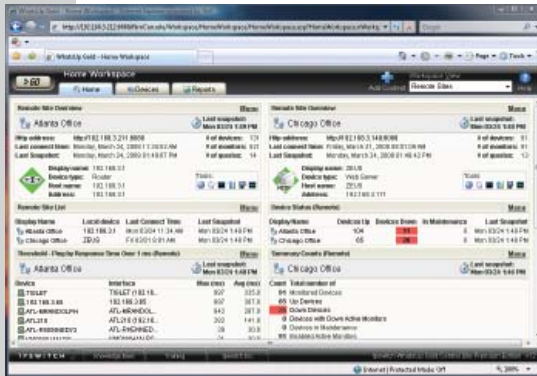
Powerful multisite network management that's cost-effective and easy to implement.

Proactive and predictive SNMP and WMI monitoring, along with powerful alerting and notification features, let you quickly identify and resolve network problems. Intuitive Windows and Web-based interfaces use dashboards to deliver real-time access to more than 150 reports, giving you vital information to keep your network strong and healthy.